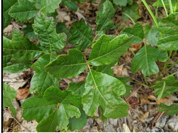
Figure 6. Poison oak vine ( Toxicodendron diversilobum )