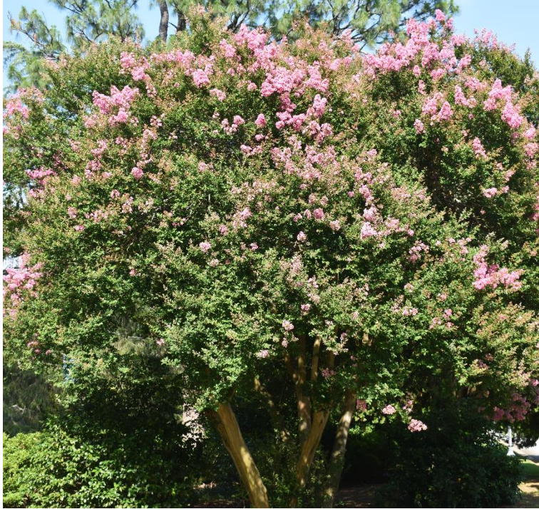
Figure 2A. Crepe myrtle tree ( Lagerstroemia indica )