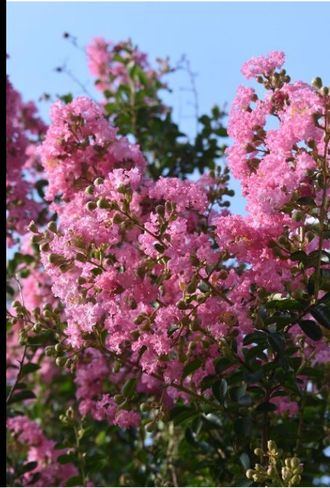
Figure 2B. Crepe myrtle flower