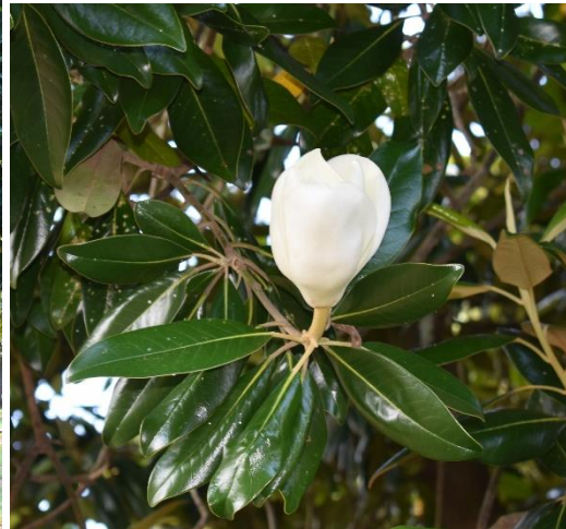
Figure 1B. Magnolia flower