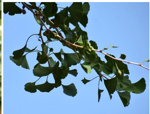
Figure 5B. Ginkgo leaves