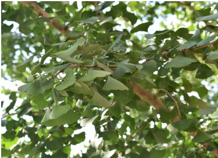
Figure 5A. Ginkgo tree ( Ginkgo biloba )