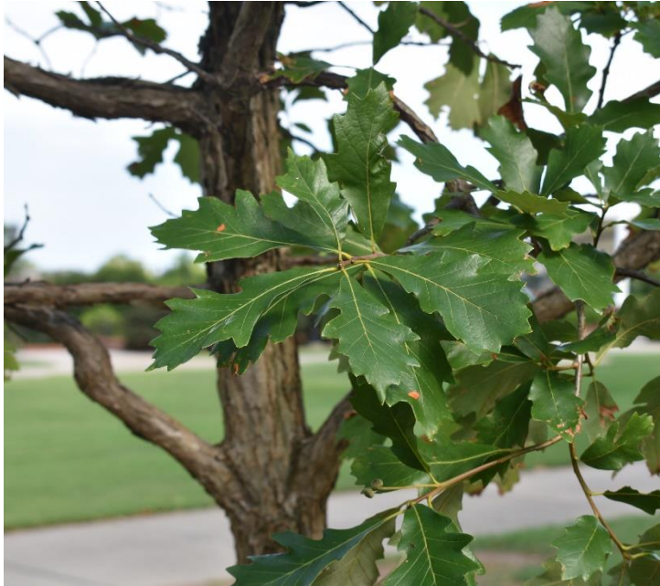
Figure 4A. White oak tree ( Quercus alba )