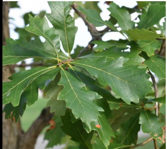
Figure 4B: White oak leaf