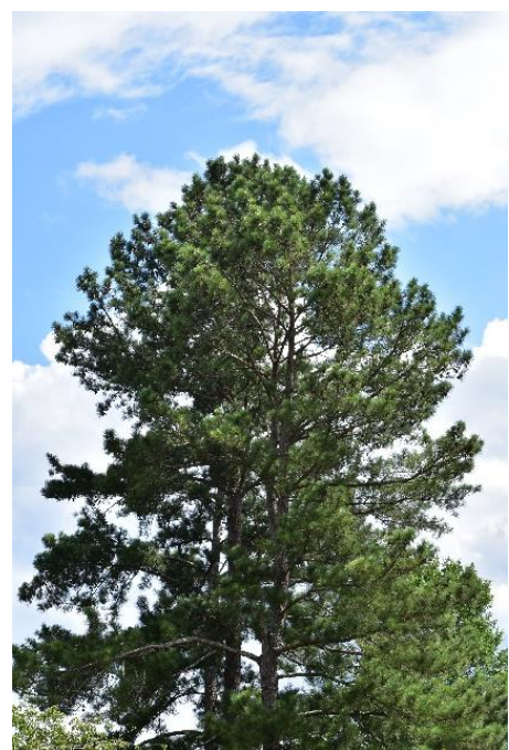
Pine tree ( Pinus strobus )